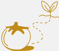
INGREDIENT TRACEABILITY P. 62