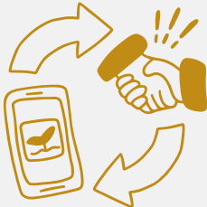
FARMER SUPPORT & TRAINING P. 57