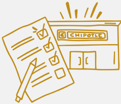
RESTAURANT INSPECTIONS P. 61