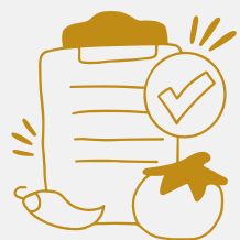
SUPPLIER INTERVENTION P. 56