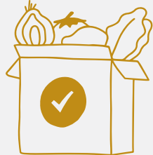
FOOD SAFETY CERTIFICATION P. 60